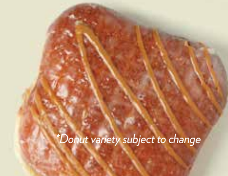
*Donut variety subject to change